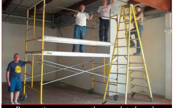
Renovation was recently completed on the Museum with the cooperation of many workers and their hours of labor.