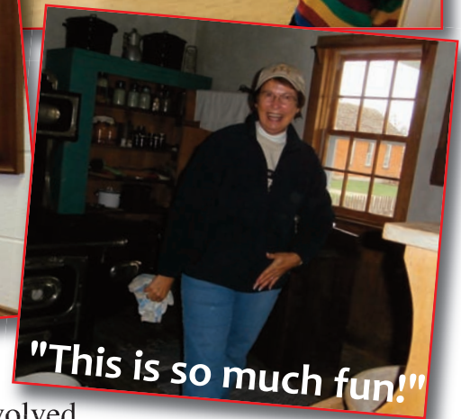
"This is so much fun!"

If you would like to volunteer just call 589-8007 and let us know how you would like to be involved.