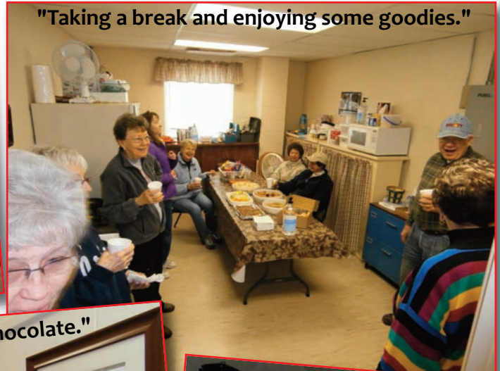
"Taking a break and enjoying some goodies."