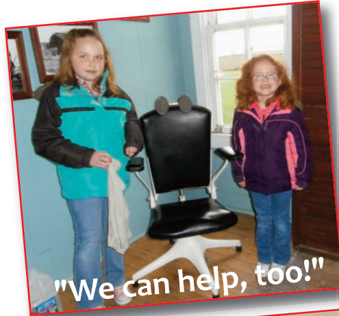
"We can help, too!"

Answering phones Assisting with computers Baking cookies Building projects Cleaning toilets Creating displays Decorating Festival help Folding letters Fundraising Gardening Greeting customers Inventory Mopping floors Moving furniture Painting Planting flowers Providing food Repairs Setting up tables/chairs Sewing Shopping Swiss Days help Taking down tables/chairs Washing Windows Watering flowers Weeding ...and much more!