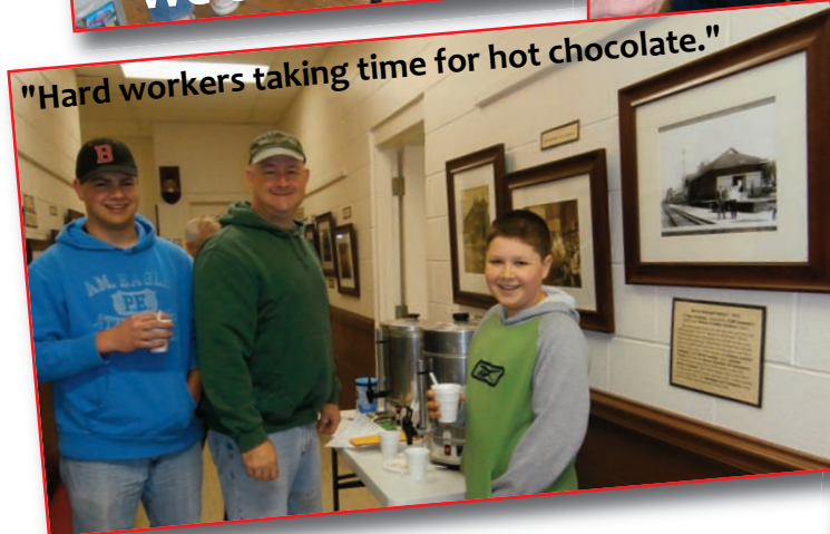
"Hard workers taking time for hot chocolate."